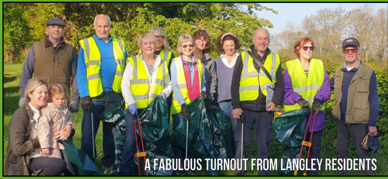
A FABULOUS TURNOUT FROM LANGLEY RESIDENTS

I've joined in two litter picks in the last couple of months. Thanks to all those who turned out to help. Of all the 5 villages, Snitterfield suffers the most from litter, likely due to its proximity to the A46. Please get in touch if you would like help organising a litter pick.