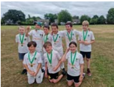
Under 11's team with their commemorative medals