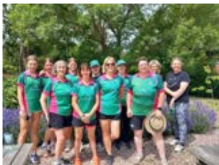
Women's Team played a pairs format

The women's team play in a development hard ball league and are welcoming to new players, whatever their standard.